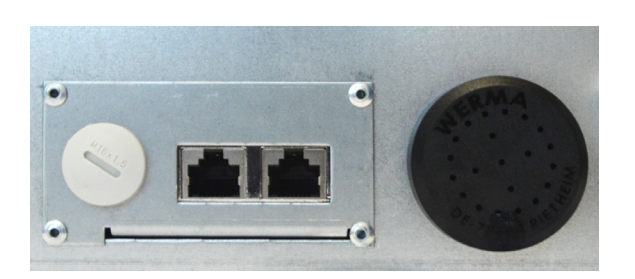
At the bottom part of TAKE THIS device are RJ45 connectors for data line and a warning siren.